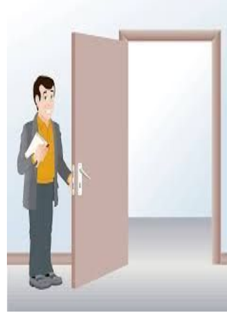
Hold the Door