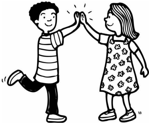
Give a high five